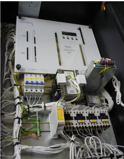
Examples of standard Qube features